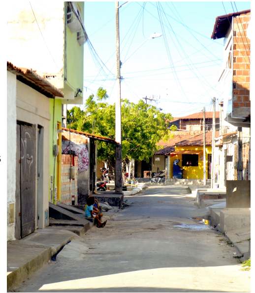
Above: A street view as you enter São Cristóvão.